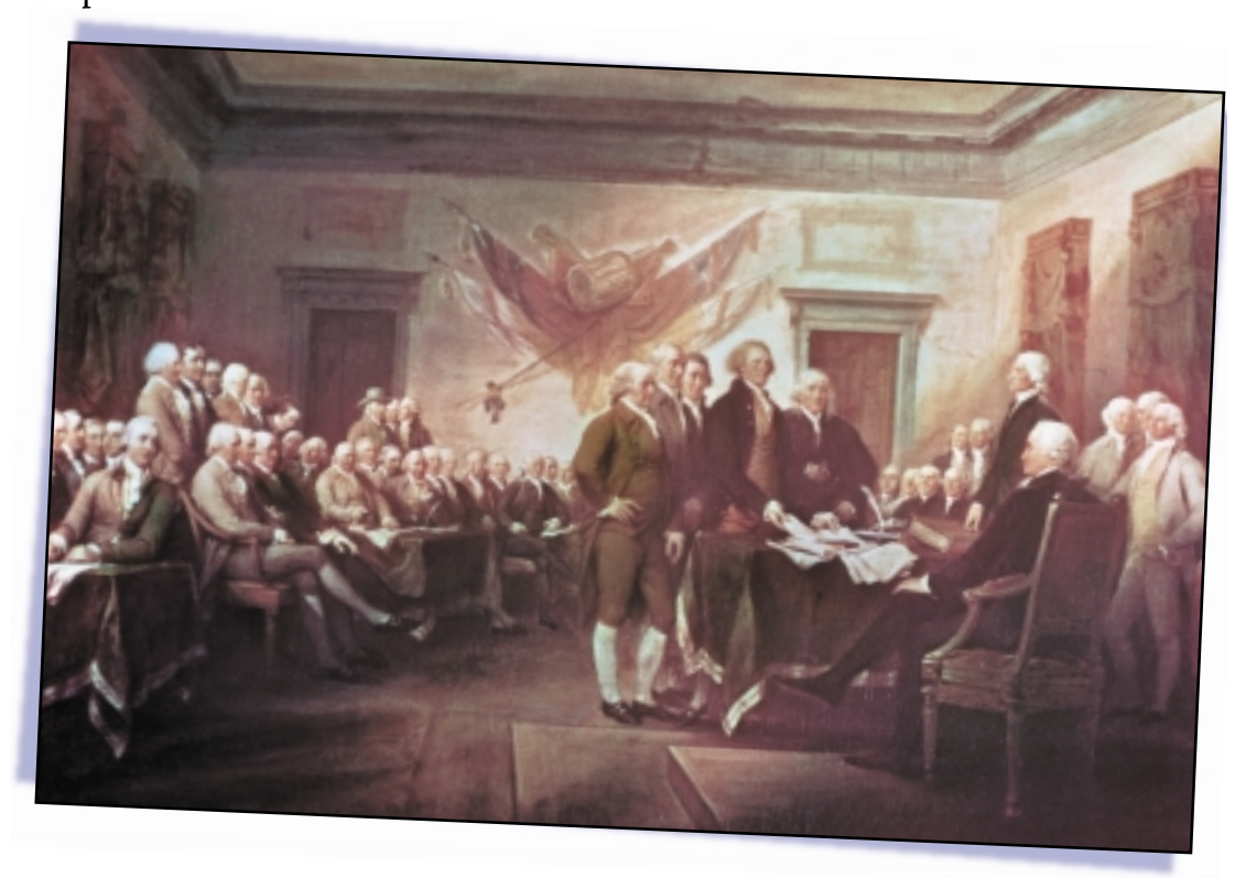
Members of the Second Continental Congress signing the Declaration of Independence

To find information, use sources such as history books, encyclopedias, biographical dictionaries, newspapers, magazines, documentary videos, and interviews.