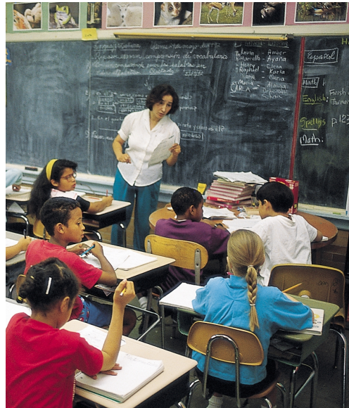
A classroom today