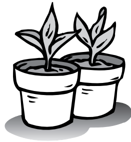
two identical houseplants