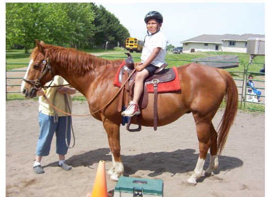
Students enjoying their time at the Reading to Ride Camp.