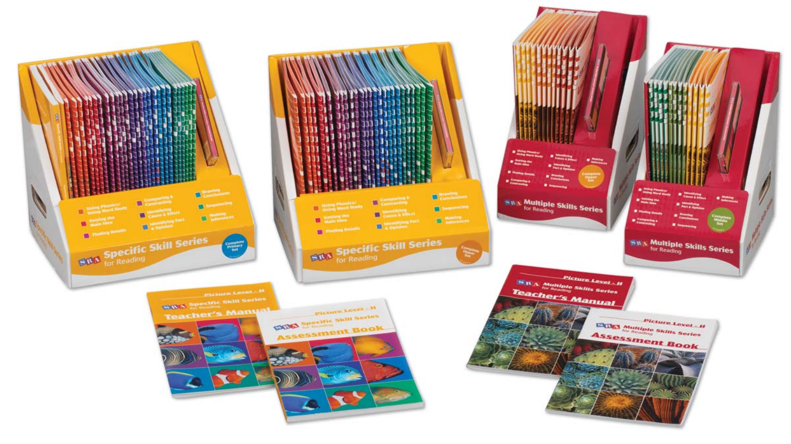
Specific Skill Series for Reading and Multiple Skills Series for Reading

Students at every skill level develop stronger reading comprehension skills with SRA's Multiple Skills Series and Specific Skill Series.