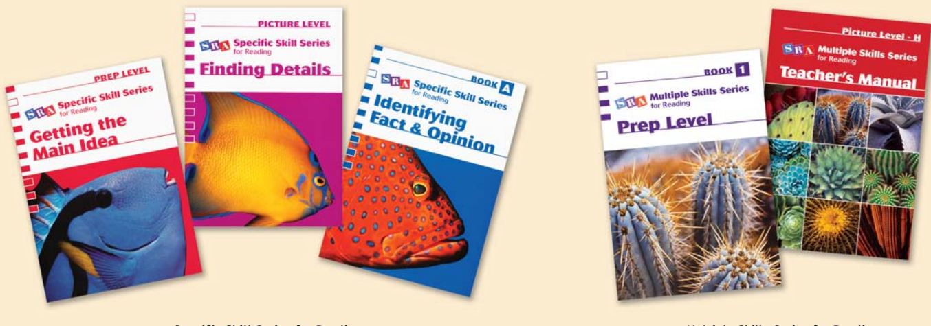
Specific Skill Series for Reading