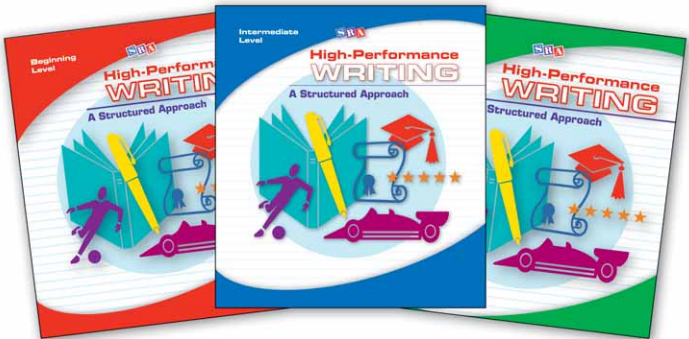
High-Performance Writing: Beginning, Intermediate, and Advanced Levels