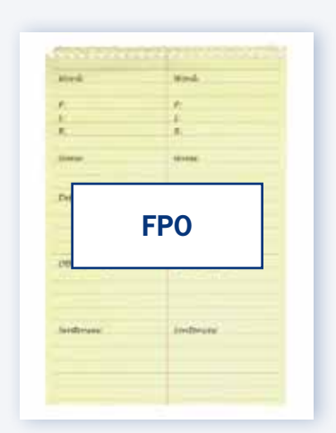
Blank Steno Pad Template