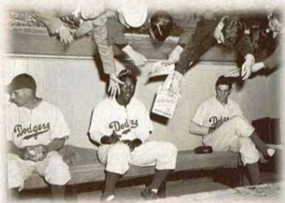
Jackie signs autographs for fans during a Dodgers game.

While Jackie was playing for the Monarchs, Branch Rickey, the president of the Brooklyn Dodgers, learned about Jackie's amazing talent for baseball. He invited Jackie to meet with him in New York. There Rickey offered him the chance to become part of the Brooklyn Dodgers. As a Dodger, Jackie would earn a higher salary. Jackie accepted the job and became the first twentieth century black American to play on a Major League team.