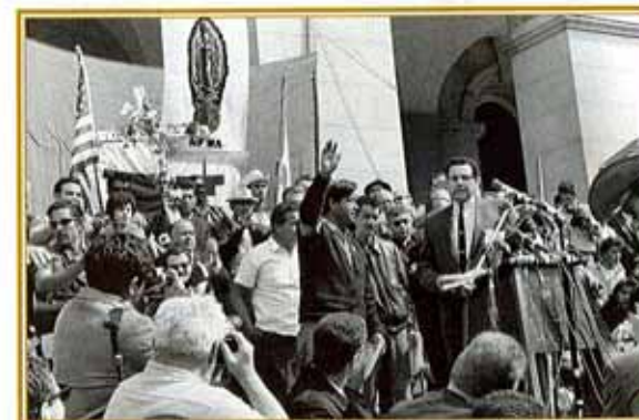
Cesar Chavez waves to the crowd from the capitol building in Sacramento, after having marched from Delano.

When he spoke, he drew from lessons learned through his difficult childhood, a childhood that began with great promise on the family farm outside Yuma, Arizona.