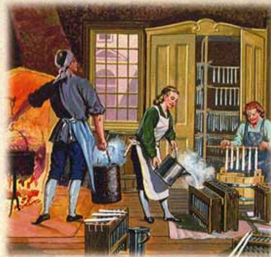
Ben hated soap and candle making.

After showing a strong dislike for his father's profession of being a soap and candle maker, Josiah tried to find a different trade for Ben. Ben tried bricklaying, cabinet making, and roof work but he disliked all of these trades. So Ben became a printing apprentice to his brother James.