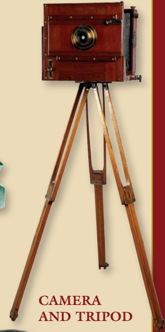
CAMERA AND TRIPOD