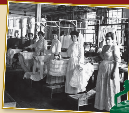
WOMEN IN SWEATSHOP

During Jane Addams's lifetime, many factories were being built, and people crowded into the cities from farmlands and from Europe. They were seeking work in the growing urban centers, struggling to improve their lives. They learned new occupations because of new inventions and technology—jobs like telegraph operator, photographer, and spinning machine and textile mill worker. Most of the factory jobs paid very little, and children were often sent to work. Jane Addams saw how these children suffered and helped to get laws passed that prevented children under the age of 14 from working in the factories. Can you imagine you or your friends working in a factory for 12–14 hours a day?