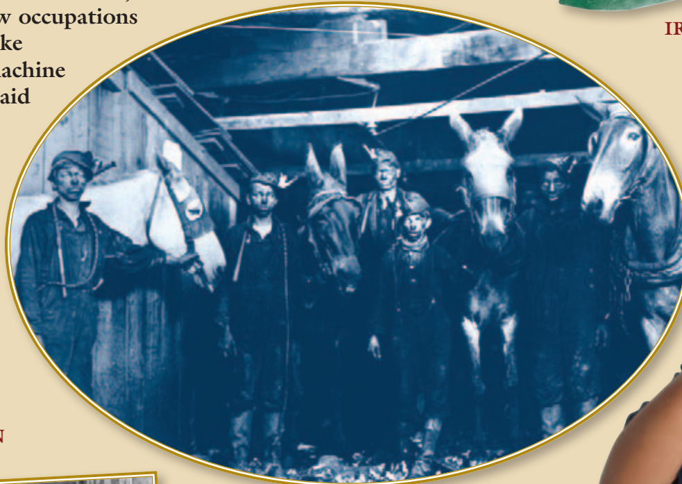
YOUNG BOYS IN COAL MINE