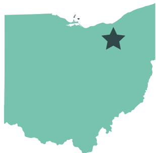
Independence Primary School Independence, Ohio