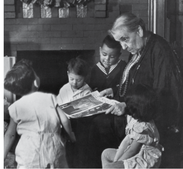
Jane Addams protected the rights of children.

A right is something you are free to do. Children have the right to go to school. What are some other rights that you have?