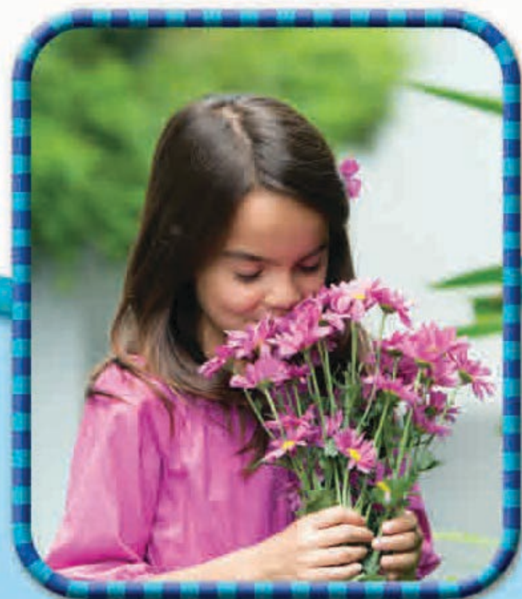
smell a flower