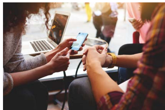
Learning that Fits mheducation.link/smartbook2