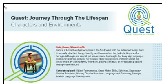
Quest: Journey Through the Lifespan https://youtu.be/IlmshMe8uWU

Power of Process – It guides students through the process of critical reading, analysis, and writing. Faculty select content, such as journal articles, and strategies for students to use to analyze and comment upon the content, gaining insight into students application of the scientific method.