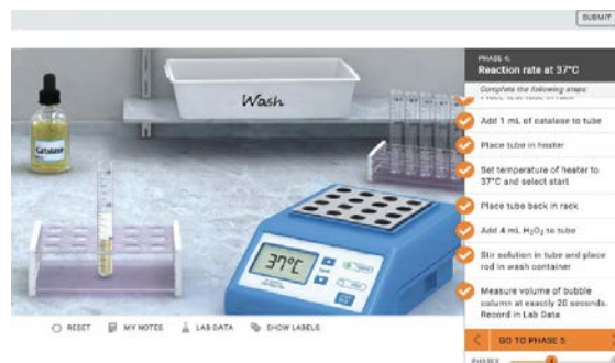
Connect Virtual Labs

Relevancy Modules demonstrate the connections between biological content and topics that are of interest to society as a whole. These modules are a supplemental eBook in Connect. Examples of topics include fermentation, weed evolution, antibiotic resistance, climate change, and more!