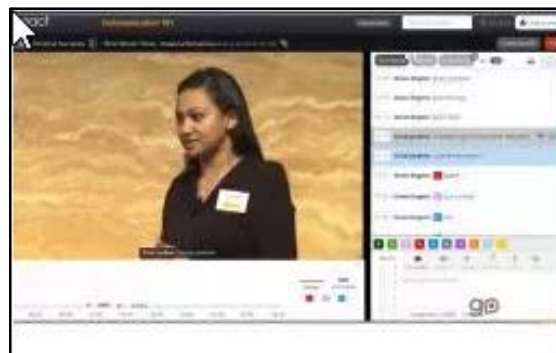
Video Capture Powered by GoReact mheducation.link/vidcap

Video Capture Powered by GoReact – It provides instructors with a comprehensive and efficient way of managing in-class and online speech assignments, including student self-reviews, peer reviews, and instructor grading.