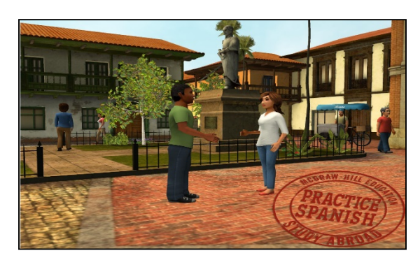
Practice Spanish: Study Abroad View Video Here