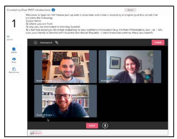
Recordable Video Chat powered by GoReact View Video Here

Vocabulary presentations – The instructor and student eBooks can now toggle to reveal an unlabeled version for convenient review.