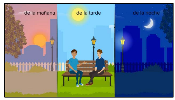
New Grammar Tutorial Videos