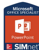
MOS PowerPoint Associate SIMbook