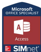
MOS Access Expert SIMbook