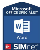
MOS Word Associate SIMbook