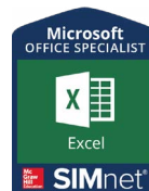
MOS Excel Associate SIMbook