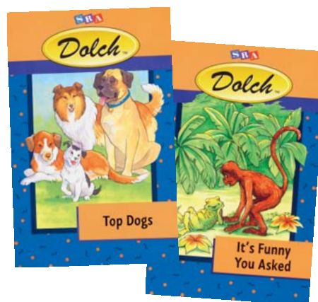
Dolch Independent Reading Books Tales and Legends

Dolch Level 2 focuses on the Dolch 95 Common Nouns and the Dolch 220 Basic Sight Vocabulary, which includes the Dolch 110 Basic Sight Vocabulary. The 16 Independent Reading Books in this level are designed for reading levels 2.0–3.0, and they come in two eight-book collections, Animal Stories and Tales and Legends . The stories at Level 2 present a careful selection of leveled sight-words and new vocabulary. As with the Level 1 materials, students use Popper Word Cards Set 2 and Phrase Cards to practice sight-word recognition for the new vocabulary list.