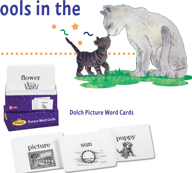
Dolch Picture Word Cards

The Teacher's Guides , one for each Dolch level, feature tips and techniques for introducing students to the sight-words lists and for using the many materials in the program. The Guides also include practice activities, workbook lessons, progress tracking tools, and formal and informal assessments.