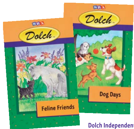
Dolch Independent Reading Books Animal Stories