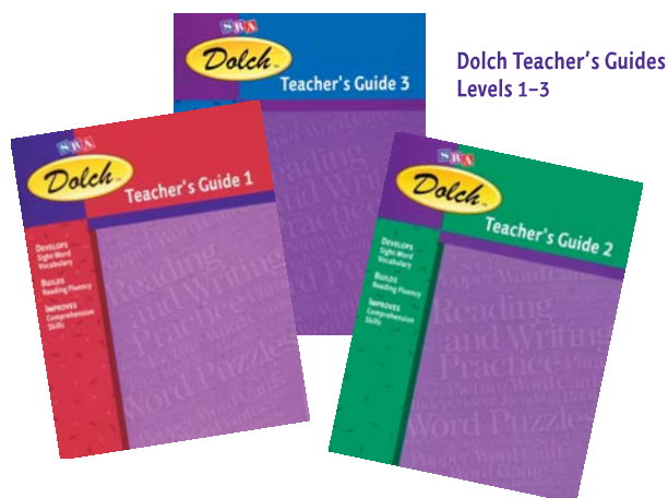
Dolch Teacher's Guides Levels 1–3

America's Journey Books – collection of 6 fiction and 6 nonfiction titles (12 total)