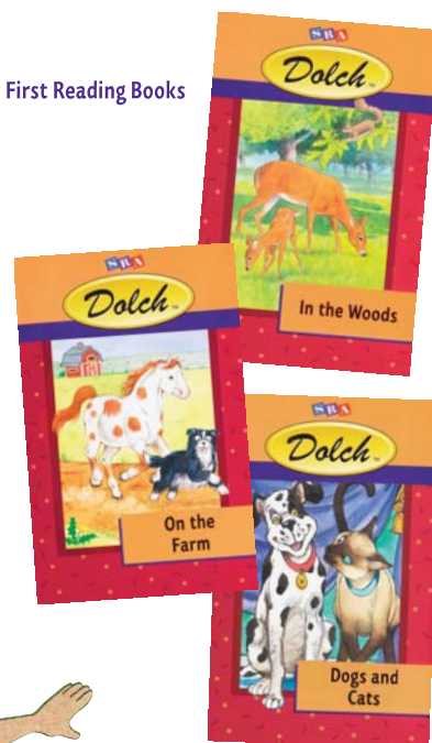
Dolch First Reading Books