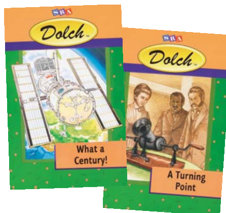
Dolch America's Journey Nonfiction

For reading levels 3.0–4.0, Dolch Level 4 presents students with the Dolch 1,000 Words, which includes the 684 Dolch Storyteller Words. The six fiction and six nonfiction titles in the America's Journey collection provide further practice in this expanded word set through high-interest stories.