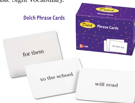
Dolch Phrase Cards

These cards are intended for Dolch Level 2, and they introduce the Dolch 220 Basic Sight Vocabulary list, which includes the Dolch 110 Basic Sight Vocabulary.