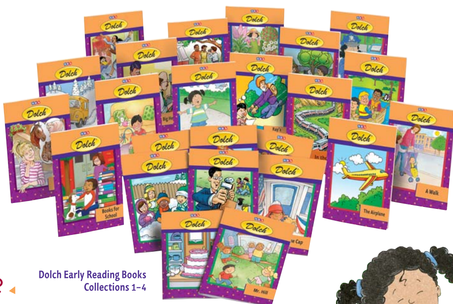
Dolch Early Reading Books Collections 1–4