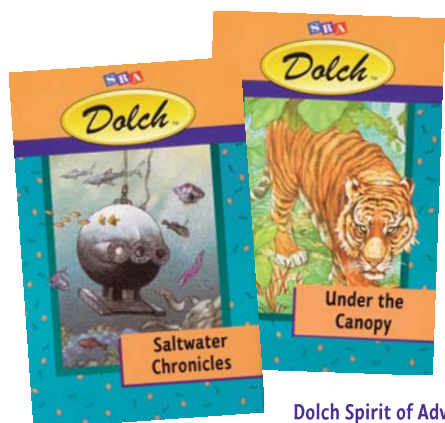
Dolch Spirit of Adventure Nonfiction