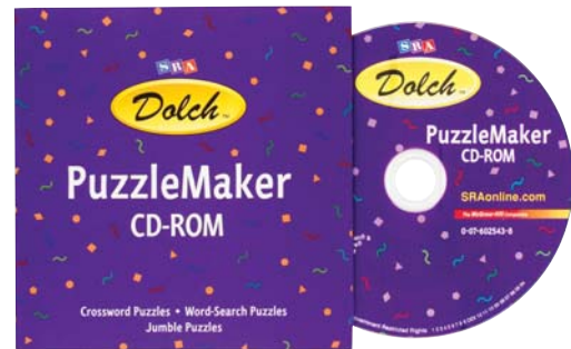
Dolch PuzzleMaker CD-ROM

Available for every Dolch level, Reading and Writing Practice Books include additional short stories and comprehension exercises designed to give students more practice with reading and writing and to help build comprehension using a variety of strategies.