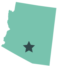
Paradise Valley Unified School District Phoenix and Scottsdale, Ariz.