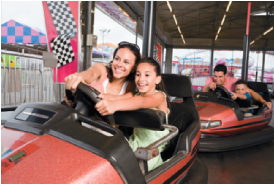
Strong families enjoy leisure activities together.

family life today. These snapshots of troubled families may be newsworthy, but the situations they describe are not new. For decades, many respected social scientists have predicted that the institutions of marriage and the family would not survive. For example, in 1927, psychologist John B. Watson predicted, “In 50 years, unless there is some change, the tribal custom of marriage will no longer exist.” He believed marriage would disappear because family standards had broken down. In 1937, Pitirim Sorokin, a respected Harvard sociologist, wrote, “The family as a sacred union of husband and wife, of parents and children, will continue to disintegrate.” Ten years later, Carl Zimmerman, also a Harvard sociologist, noted, “There is little left now, within the family itself or the moral code, to hold the family together” (Bernard, 1970, p. 42).